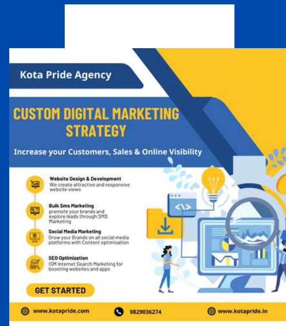
Customised Marketing (Digital Marketing Packages)