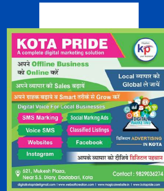
5 Star Marketing (Digital Marketing Packages)